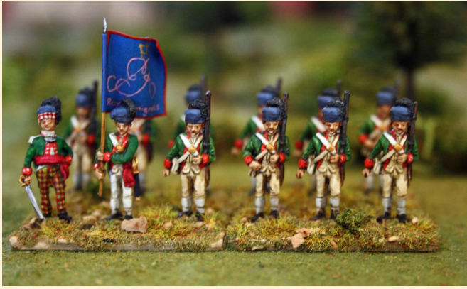
The Royal Highland Emigrants