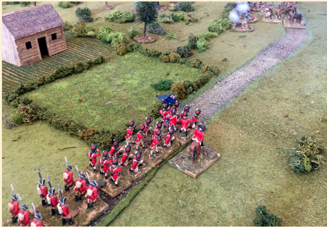
Major Preston advances

Lorimier's Mohawks are engaging the Americans from hidden positions in the forest as shown on the map. Some of the Habitants may be deployed defending the northern farm. Preston is marching from the fort along the road. Two medium guns from the fort ramparts may engage any enemy in sight and range.