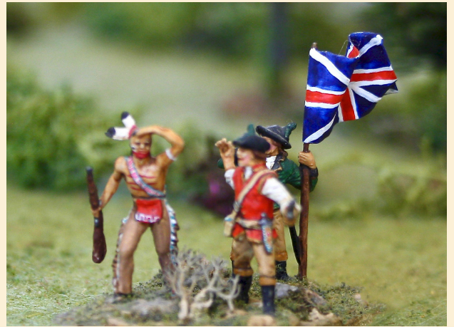
Major Guillaume, Chevalier de Lorimier