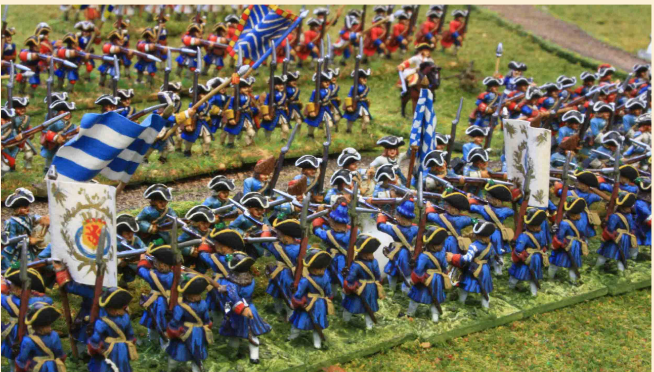
The Dutch Blue Guard (foreground) stands firm against an attack by Bavarians, Swiss and Germans.

The terrain is flat and open, however there is boggy ground in the area of the two streams.