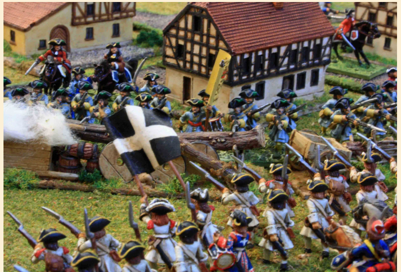
The French Regiment Navarre attacks the fortified village of Ennetieres which is defended by Danes.

Foot may include Irish, Swiss, Bavarians and other Germans. Carabiniers and Horse may include Bavarians. Two squadrons of Dragoons may be replaced by Bavarian Hussars.