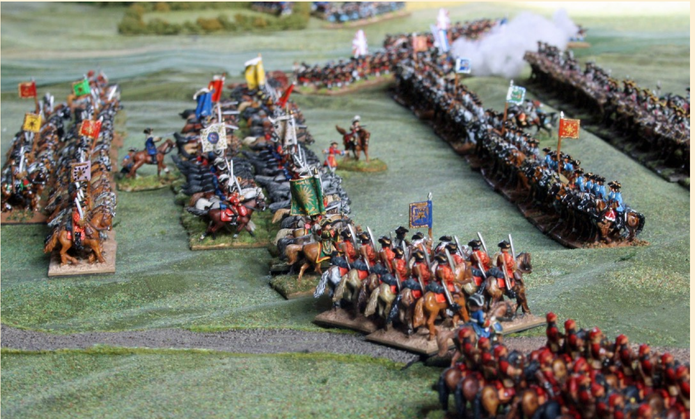
The cavalry lines clash

The Franco-Bavarians win a decisive victory if they hold Taviers and suffer less casualties than the Allies. They win a marginal victory if they do this but suffer the same or more casualties than the Allies.