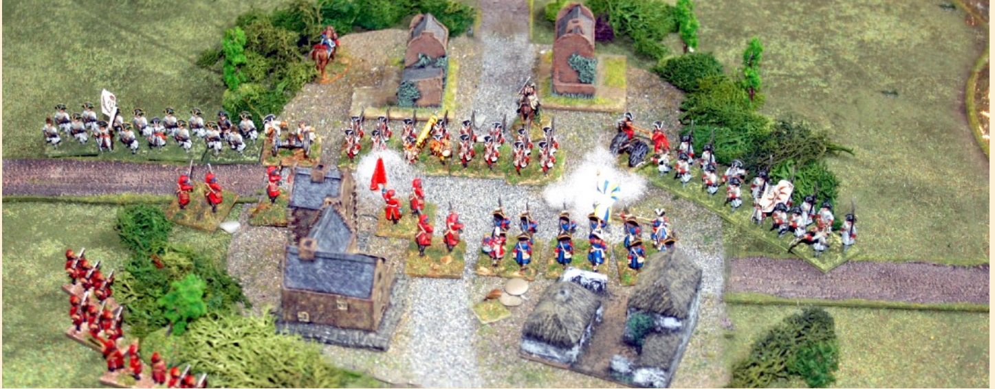
Swiss and dismounted French dragoons defend Tavier from the Dutch assault.

The Allies may deploy anywhere up to 240 yds in from their table edge in line or column. Any number of units may be kept off table to arrive at any time the Allied player wishes.