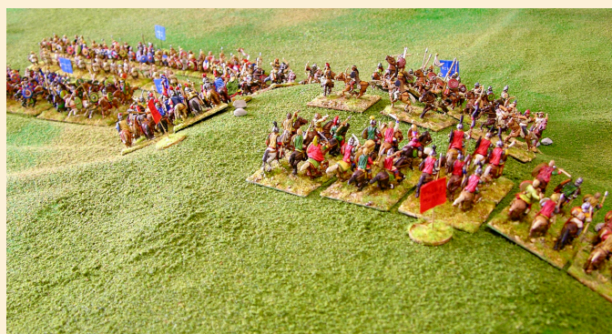
Visigoths and Huns fight for control of the high ground at the Society of Ancients Battle Day 2013.

When Attila crossed the Rhine in 451, the Roman commander Aëtius moved from Italy to France taking with him only a small force of maybe a couple of thousand Auxilia and a few cavalry. He linked up with his former enemies, the Visigoths, who were led by their King Theodoric and his son Thorismund. The Visigoths held the right wing, Alans under Sangiban the centre, and Aëtius with Romans, Franks and Armoricans on the left.