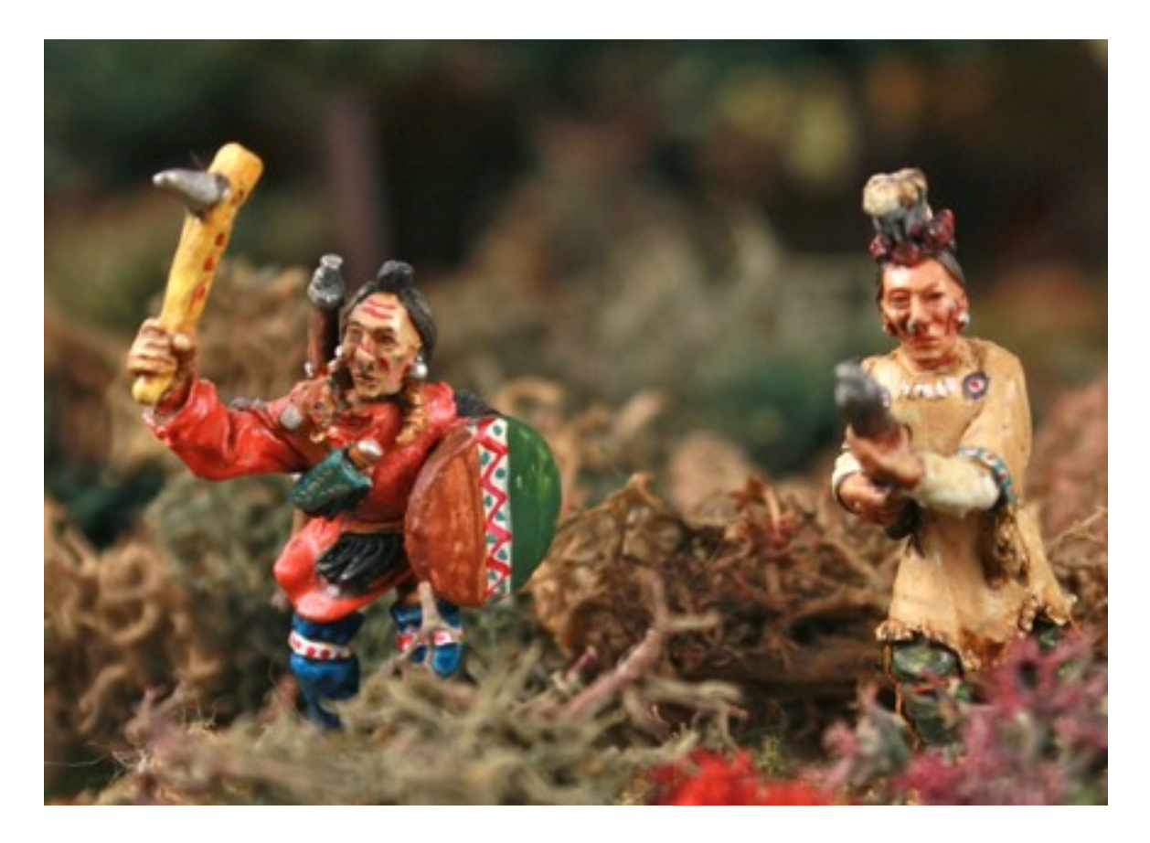
North American Indians break cover to pursue broken enemy