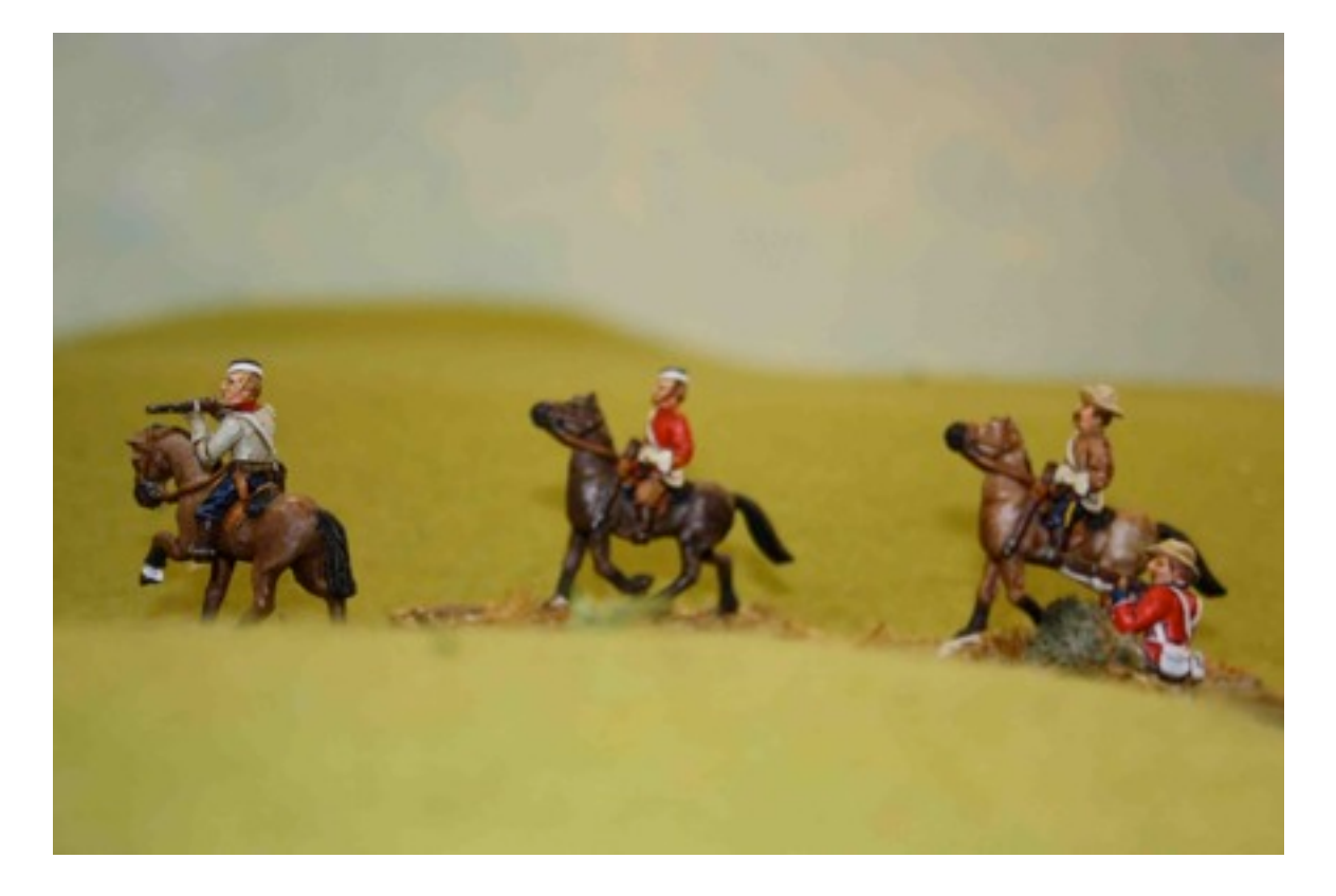
A Northwest Mounted Police patrol in the late 19th Century. La Petite Guerre is suitable for low-level warfare from the 17th to 19th Centuries.