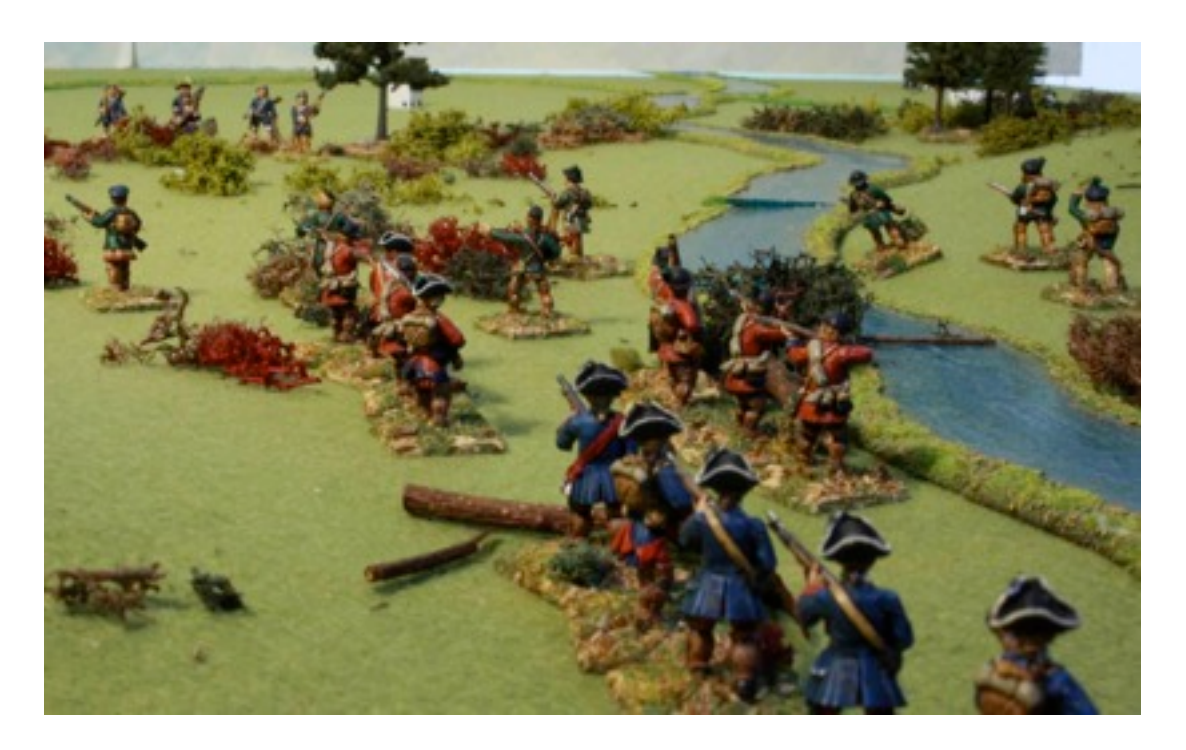
Figures moving in single file follow the movement of the lead figure. If he is within command radius he may move as he wishes and the others follow without having to take a control test. If the lead figure is not in command, he must take a control test and all the others will follow his result.

Command radius is reduced by 10 paces if the leader is under fire. Musicians and standards increase a Leader's Command Radius by 20 paces if the musician or standard is within 20 paces of the leader. The standard must be visible to the men but a musician can extend command radius beyond normal visibility limits.