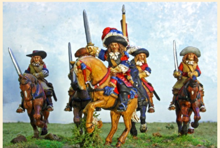
James, Duke of York (later King James II) commanded the British Royalists on the Spanish side at the Dunes.

All numbers in the following orders of battle are bases of 2 cavalry or 4 infantry, not individual figures.