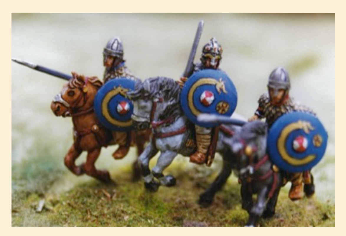
After disbanding the Praetorians, Constantine replaces them with new guards units called the Scholae. These particular troopers are from the Scola Scutariorum Secunda

Roll a D6 for each unit routing or retiring over the bridge. If the result is '1' the bridge collapses and becomes impassable. All troops crossing it that turn are destroyed.