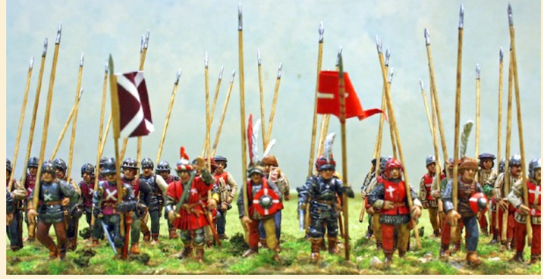
Tudor's French and Scots pikemen

All numbers below are Tree of Battles bases of 5-7 foot or 2-3 mounted