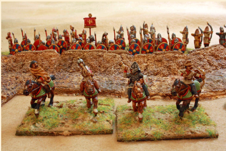
Belisarius deployed his infantry behind trenches with detachments of Massagetae in front.