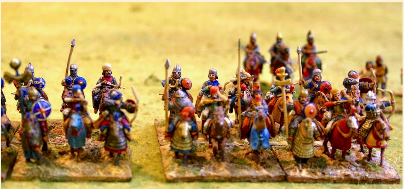
The Persian Clibanarii (heavy horse archers). Deployed in supported line, the rear ranks may shoot overhead at long range and provide support in combat.

There is no evidence that the Cadiseni were cataphracts, players may choose to represent them by the elite clibanarii if they prefer. The Cadiseni should be in Pityaxes second line.