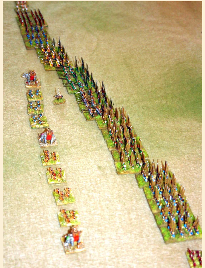
Antigonos advancing in echelon from the right